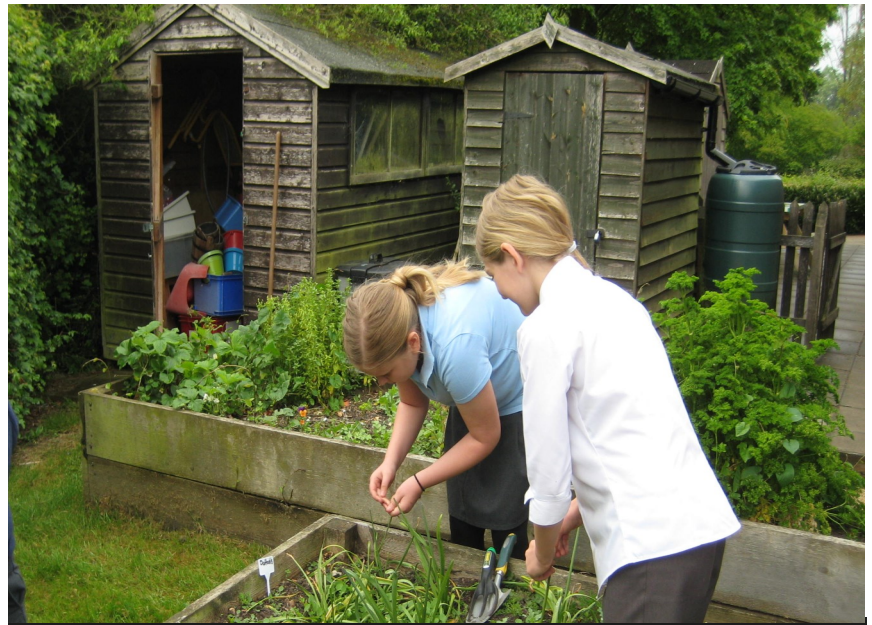
Caring for our environment

We have an open door policy whereby parents can arrange to meet with staff or pass on messages at the classroom door.