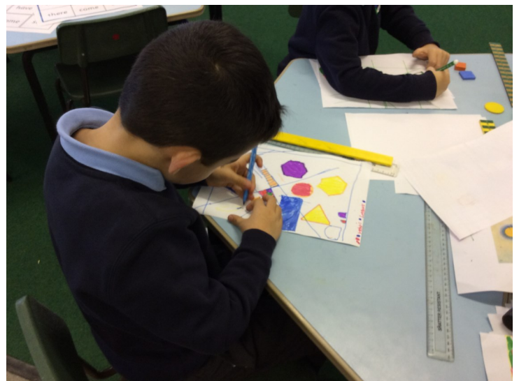
Inspiring young mathematicians

Our aim is for 100% attendance. We give certificates for good attendance at the end of each school year. Holidays in term time will not be authorised.