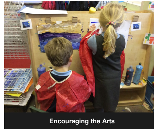
Encouraging the Arts

"Staff are welcoming, approachable and friendly."