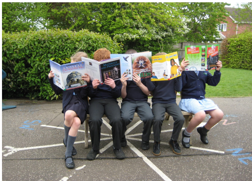
Encouraging a love of reading