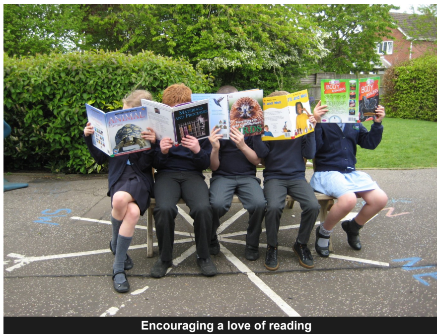
Encouraging a love of reading