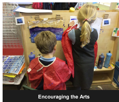
Encouraging the Arts

"Staff are welcoming, approachable and friendly."