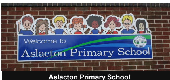
Aslacton Primary School

In addition to the building there are extensive attractive, landscaped grounds, which provide interesting and lively learning and play opportunities for children of all ages.