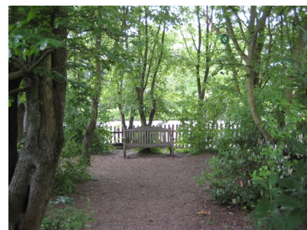
Our lovely, rural setting

We make the most of our fantastic school grounds and forest schools areas by taking our learning outdoors when we can.